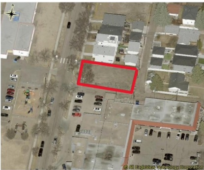
9115 143 St-Location