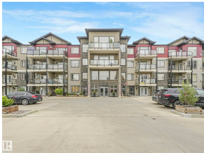
312-12408 15 Ave SW, Edmonton, AB